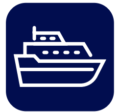
Boat trip or cruise