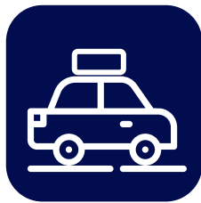
Road trip to multiple destinations