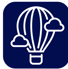
Adventure or activity holiday