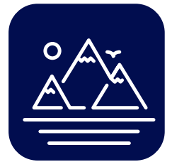
Lakes and mountains