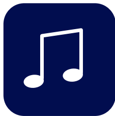
Trip based around a music event